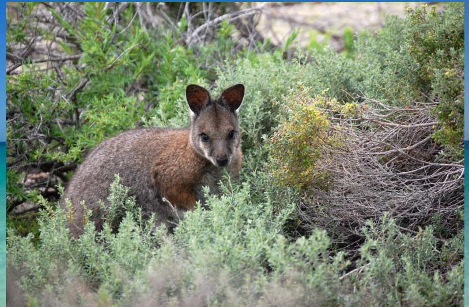
Lizards, wallabies, birds, sea lions