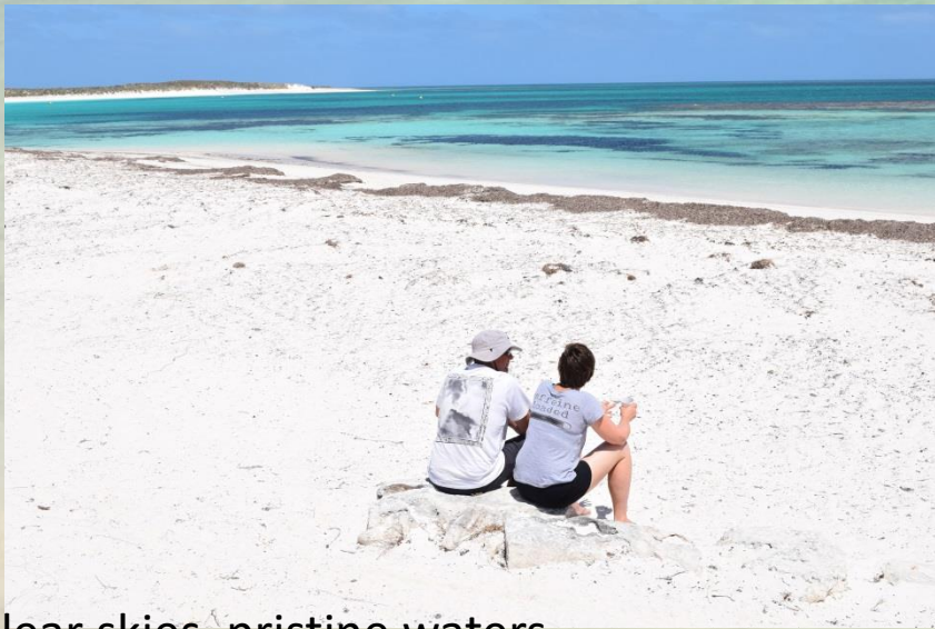
Clear skies, pristine waters